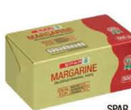
SPAR Margarine Brick 500 g

Promotion price R15 99 Get an extra R1 off Rewards customers pay R14 99