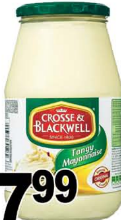
Crosse & Blackwell Mayonnaise 700 G