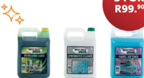
ANY 5LT DETERGENTS FOR R99.90 GREEN DISHWASH LIQUID | AMMONIATED CLEANER | FABRIC SOFTENER