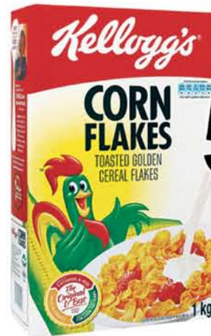
Kellogg's Corn Flakes 1 Kg