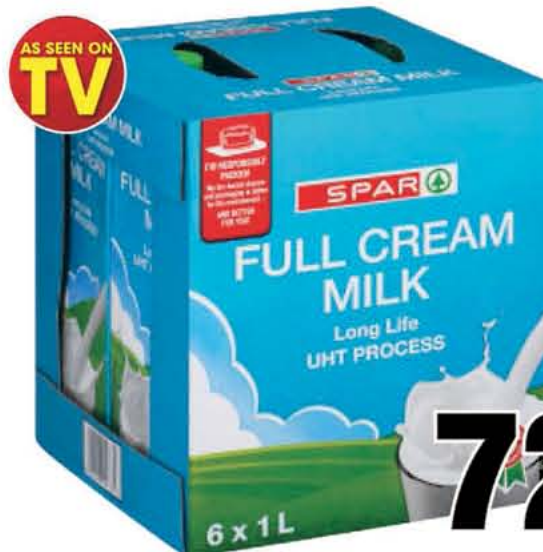
SPAR UHT Long Life Milk (Full Cream, 2% Low Fat or Fat Free) 6 x 1 litre