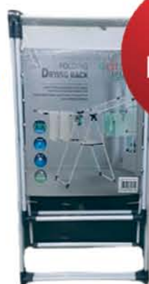
CARBON STEEL CLOTH DRYER RACK MORE SIZES IN STORE