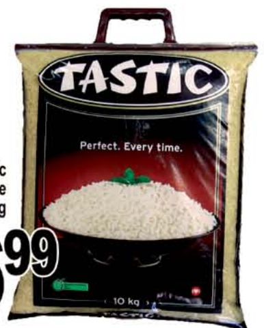
Tastic Rice 10 Kg