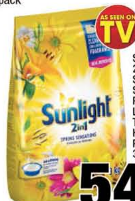
Sunlight 2 in 1 Spring Sensation Regular, Lavender or Tropical Hand Washing Powder 3 kg

Promotion price R15 99 Get an extra R1 off Rewards customers pay R14 99