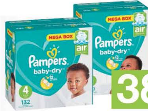
Pampers Active Baby Dry Disposable Nappies Mega Box Maxi (132s), Midi (150s), Maxi+ (120s) and Junior (111s)