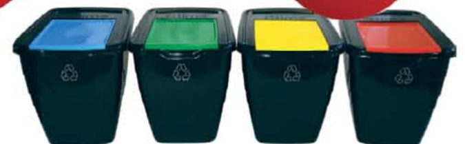
40LT RECYCLE BIN