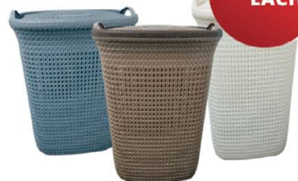
KNIT LAUNDRY BASKET TURQUOISE | PEARL WHITE | SILVER | CAPPUCCINO