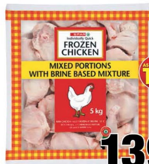
SPAR IQF Chicken Mixed Portions 5 kg