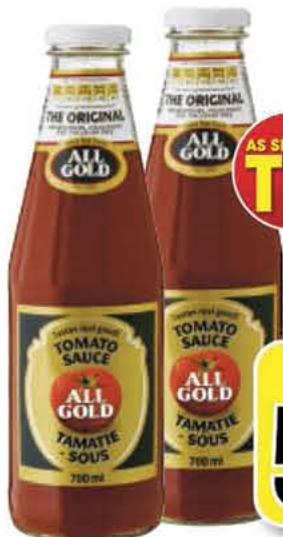
All Gold Tomato Sauce 700 ml