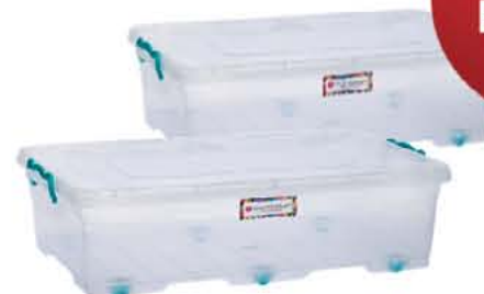
30lt CLEAR CLIP & LOCK STORAGE BOXES MORE DEALS IN STORE | 40LT | 50LT