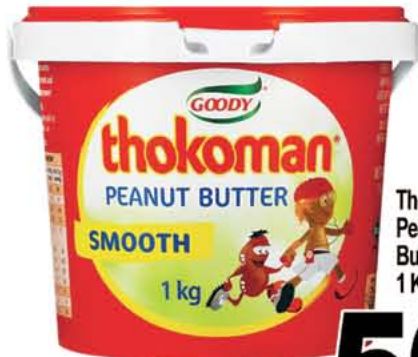
Thokoman Peanut Butter 1 Kg