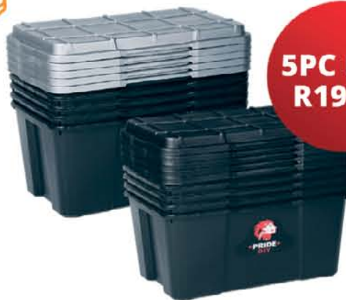
PRIDE STORAGE BOX BOX SET OF 5 | 25LT