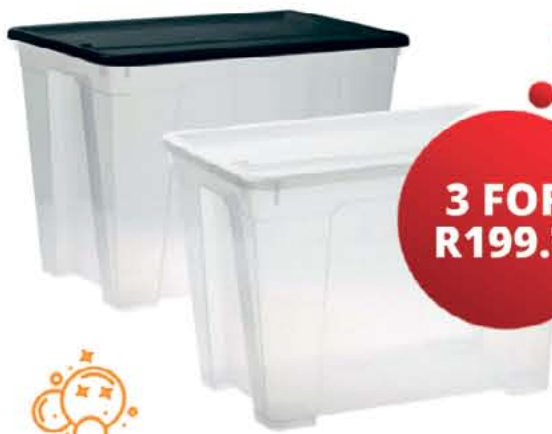
21lt CLEAR STORAGE BOX CLEAR OR BLACK LID MORE DEALS IN STORE | 45LT | 65LT