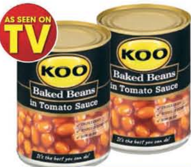
Koo Baked Beans in Tomato Sauce (excl. Lite) 410 g