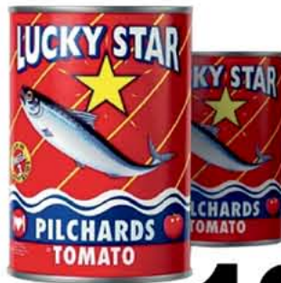
Lucky Star Pilchards 410 G