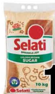
Selati Golden Brown Sugar 10 kg