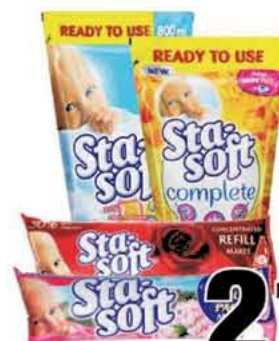
Sta-Soft Fabric Conditioner Refill 500 ml or Ready To Use Doy Pack 800 ml