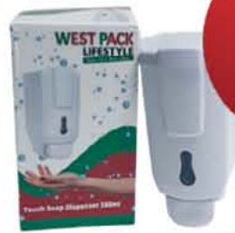
550ML SOAP DISPENSER MORE DEALS IN STORE | 1000ML