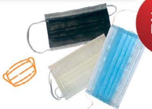
COLOUR MASKS BLACK, YELLOW, BLUE | 10PC PER SET

VALID UNTIL 28 FEBRUARY 2021 - WEST PACK EXPRESS GROBLERSDAL