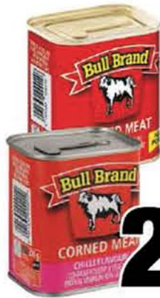
Bull Brand Corned Meat (All variants) 300 g