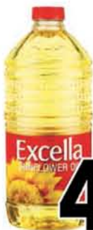
Excella Sunflower Oil 2 litre